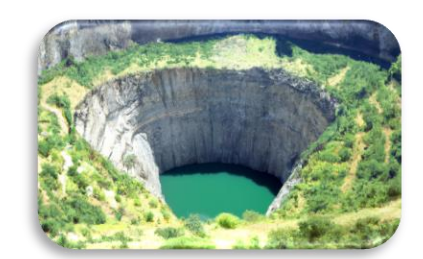
Water-filled quarries and pits hide rock ledges, machinery, electrical currents, and other hazards. The water may look refreshing but can be deceptively deep and dangerously cold. Steep, slippery walls can make exiting the water difficult.