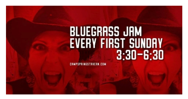
Camp Springs Tavern, 7009 Stonehouse Rd., Melbourne, KY 41059