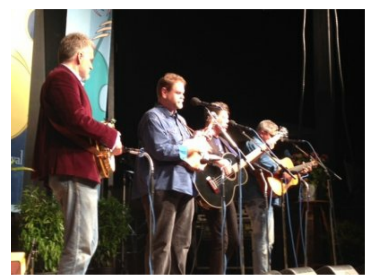
The Ruhks at FOTBG