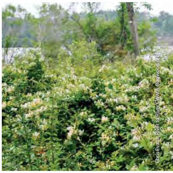
Japanese honeysuckle forms dense mats of plants that smother existing vegetation on the ground and into the tree canopy.