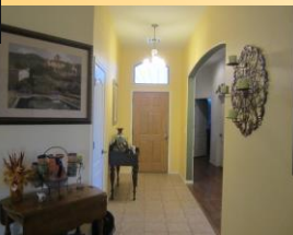
For Sale by Owner