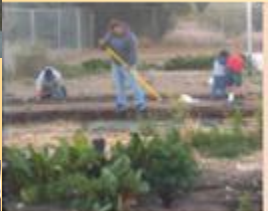
Neighborhood Community Garden