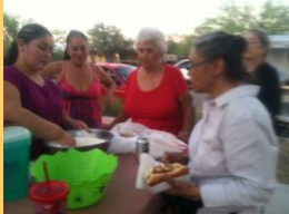
Neighborhood Park Fun