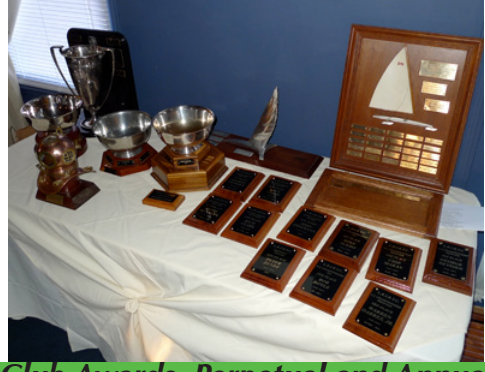
Club Awards Perpetual and Annual

We had a nice turnout for the annual awards banquet in April to wrap up the season. Friends, food and awards. If you didn't make the banquet you missed an enjoyable evening. It is fun to see everyone off the ice in a relaxed setting and many "better halves" get to meet the folks we spend our winter weekends with.