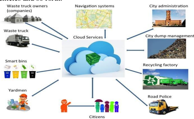
Fig: 2 The big picture of a waste collection management system.[5]

70% and with the assistance of GSM module the information of Arduino Uno will be send to framework. The framework will comprise of IIS server including API, web application and furthermore database. Web application will be taken care of by administrator, where administrator can screen and track the vehicles and so forth.