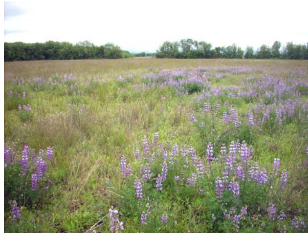
Phase One Area in Spring 2011