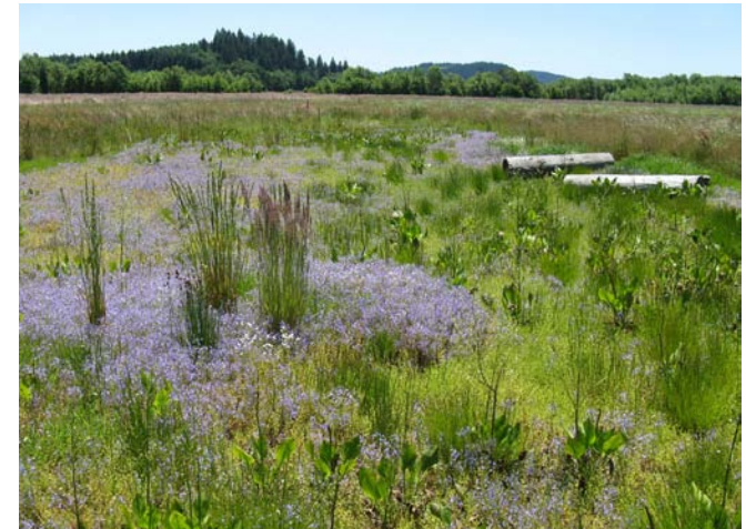
Phase Three Area in Spring 2012