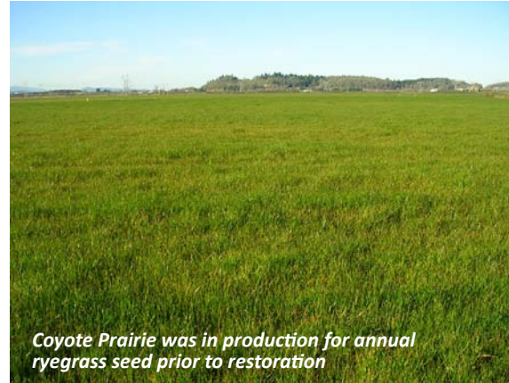
Coyote Prairie was in production for annual ryegrass seed prior to restoration

With funding assistance from the U.S. Environmental Protection Agency, Lane Council of Governments, City of Eugene, University of Oregon, and the Institute for Applied Ecology have been conducting a series of replicated field experiments at Coyote Prairie. The goal of the research is to improve the science and success of wetland prairie restoration efforts on large scale sites such as Coyote Prairie. The experiments look at all phases of the restoration process including site preparation, plant establishment, and long-term management. Researchers have been utilizing fifty 15-meter by 15-meter test plots located on the northern edge of Coyote Prairie since 2006 and will have compiled into a restoration guide by 2014.