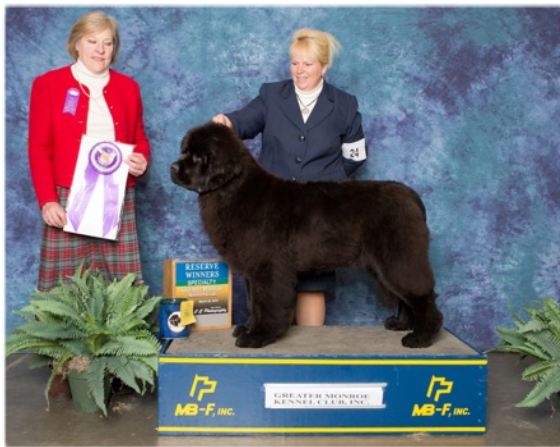
Starina (Avalon Bey's Dancing Queen) was Reserve Winners Bitch on Saturday,