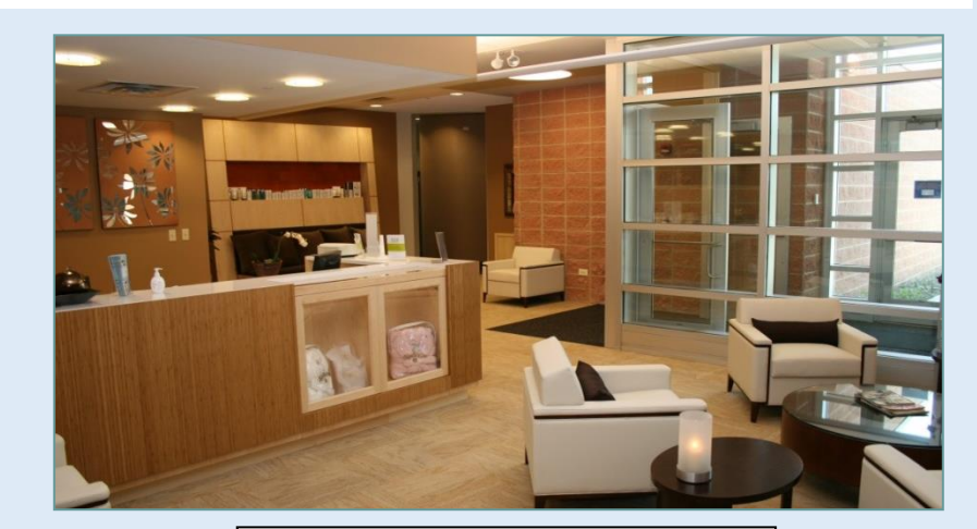
Buffalo Grove, Illinois

Opened in 2000, the Buffalo Grove Health & Fitness Center, Buffalo Grove, Illinois was developed as a community partnership between the Buffalo Grove Park District and Northwest Community Healthcare in Arlington Heights, Illinois. This 72,000 square foot health and fitness center exceeded membership expectations from its inception. This center offers wellness programs for all ages of the community. In 2007, the Center was expanded by 8,000 square feet to include a medically based spa, sports performance training and additional group exercise rooms.