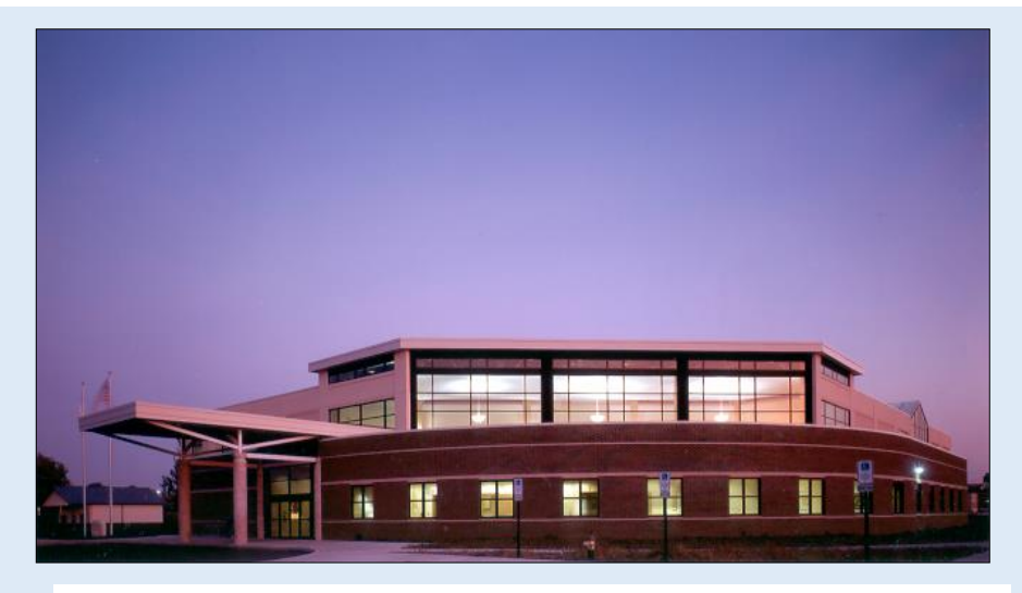
Chicago Heights, Illinois

In December, 2006 this center added an additional 7,500 square feet. The addition included a full service medically based-spa and a second women's locker room offering its members additional amenities.