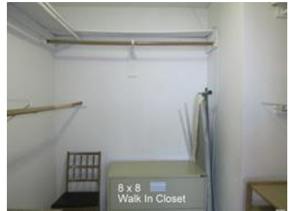
8 X8 CLOSET