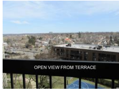
TERRACE WITH OPEN VIEW