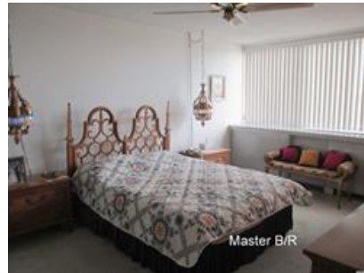
M-B-R W 8 X8 CLOSET