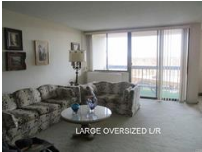
L/R WITH WATERVIEW