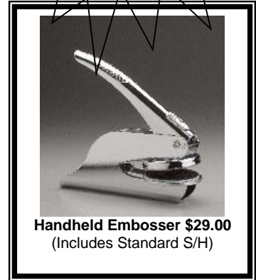
Handheld Embosser $29.00 (Includes Standard S/H)