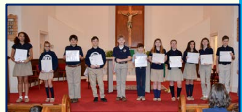
These middle school students were invited to join the NJHS