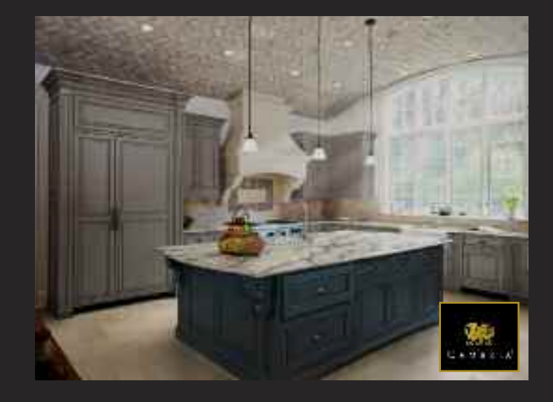
CUSTOM COUNTERTOPS "Spince 1993"

Serving Savannah and the surrounding areas for OVER 20 Years!