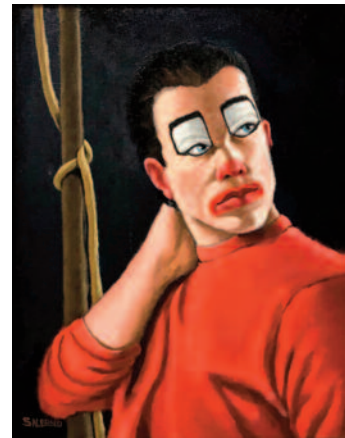
“Student Study (2)” _ Tom Salerno Oil