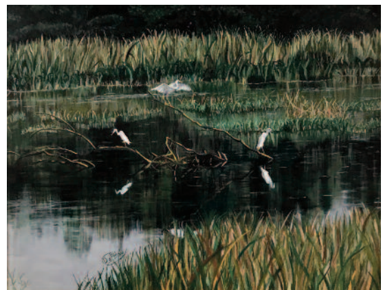
“3 Egrets Reflecting On The Day” _ Dede DeHon Oil

PEOPLE'S CHOICE - “Look, See, Think” Show