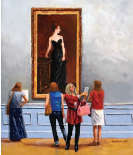
Selfie with Madame X_