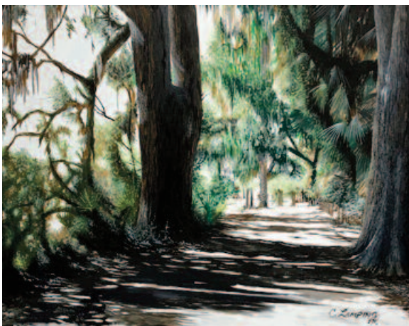
“Georgia Days” _ Charles Lamping Oil