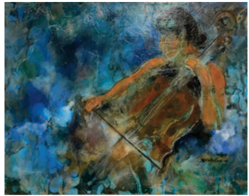
“Rhapsody in Blue” _ BJ Collister Acrylic and Rice paper