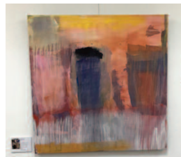
The Palm Beach Habilitation Center's PACE program participants exhibited their artwork in the gallery during our "Look, See, Think" show.