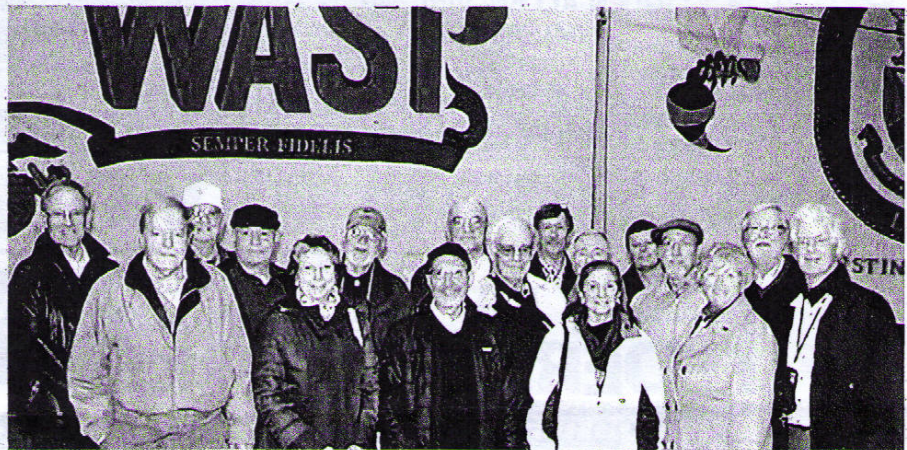
A group of medical providers (17) joined Council for this trip; with emphasis placed on the medical capabilities of the USS WASP