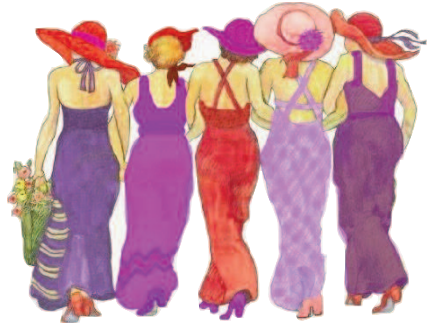
"True friends are like diamonds – bright, beautiful, valuable, and always in style."