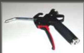
Low Noise Air Nozzle Part Number: 13-035

Low noise air nozzle creates a concentrated air stream, generates a powerful, quiet airflow and is OSHA compliant