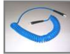
Spiral Air Hose