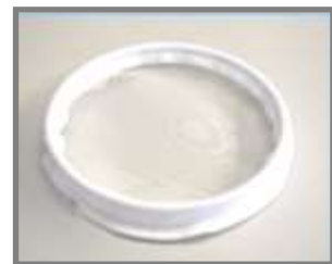
12" Basket Liner Part Number: 15-104

For use with: 12" dia. MiJET models only