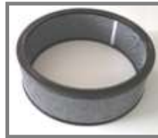
Carbon Filter for 12" dia. MiJET

An additional layer of filtration to capture odorous pollutants (slips over the standard filter)