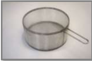
12" dia. Parts Basket Part Number: 15-110

Fine mesh stainless steel, single handle basket