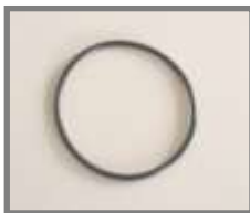
O-ring for Fluid Filter