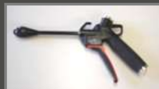
Low Noise Air Nozzle - Rubber Tip Part Number: 13-071

Low noise air nozzle with rubber tip for sensitive applications, prevents unnecessary scratching