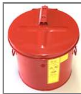
Dip Container, 3.5 gal. Part Number 15-101

For use with: 12" dia. MiJET models only