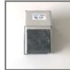
Pneumatic Foot Pedal

Used in place of the standard MiJET filter, reduces odorous pollutants