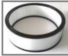
Filter for 12" dia. MiJET