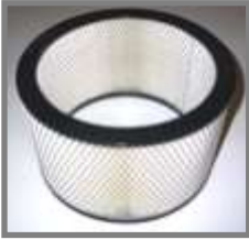
Filter for 8" dia. MiJET