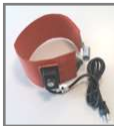
Custom Heater with Mounting Bracket

Provides ample workspace along with the MiJET.