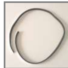
Bottom Ring Rubber Replacement

Can be used with all Workstations or Wash Stations to heat fluid inside the Dip Container.