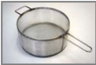
12" dia. Double Handle Parts Basket Part Number: 15-105

For use with: 12" dia. MiJET models only