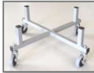
12" Drum Dolly Part Number: 13-070

For use with: 12" dia. MiJET, Angled model: 15-12SX-20ANG