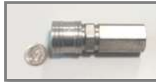
High-Flow Quick Connect Fitting, Body Part Number: 13-067

For use with: 8" dia. MiJET, Flat top model 15-12SX-20FT