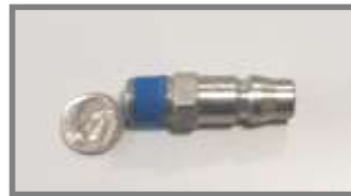
High-Flow Quick Connect Fitting, Plug Part Number: 13-068

For use with: 12" dia. MiJET models only