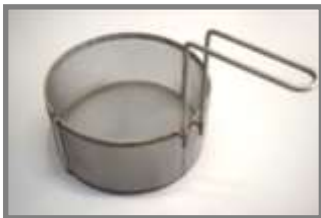
12" dia. Station Parts Basket Part Number: 15-107

For use with: 12" dia. MiJET models only