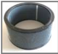
Carbon Sleeve for 8" dia. MiJET