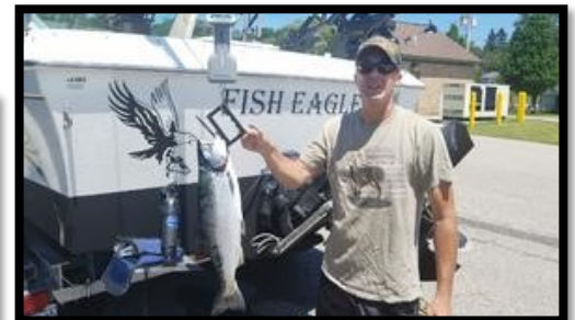
Fish Eagle - 5.95# Coho - 7/3/18