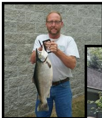
Highway Man - 9.70# Brown - 7/11/18