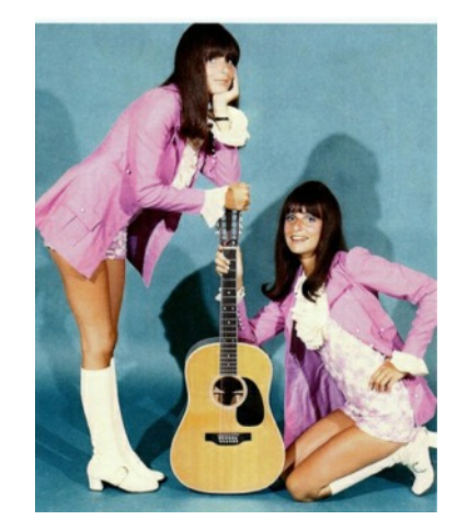
The Doublemint Twins Tour Vietnam in 1968