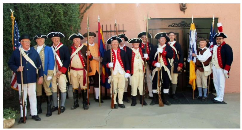
Thirteen members of the Arizona State Color Guard prepare to present colors at BOM