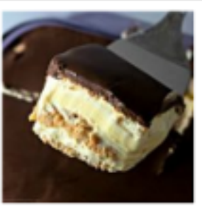
★★★★★ 5 from 9 votes