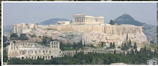
The Propylaea is corresponding to the star Celaena and the Erechtheum on the north side of the Acropolis is corresponding to the star Electra. The 6th star in the core of the Pleiades, excluding Atlas is that of Merope.