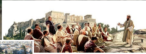
THE APOSTLE PAUL PREACHING ABOUT THE UNKOWN GOD

To the Luciferians, such a Martian motif represent the image and likeness of Lucifer. He is the 'Serpent' of old weaving through the hexagram, the Dragon that is a total counterfeit that has captured the 'Pleiades'. This is in as much as the metaphor of the Pleiades played-out in the capture of Eve in the Garden of Eden. The Pleiadian motif of what YHVH originally created and seeks to reclaim and restore through the work of Jesus Christ. It was for this reason that GOD the Holy Spirit sent Paul to Athens, to this precise hill of the Martian 'gods' to preach to the people about the 'Unknown God'. The Apostle Paul climbed Mars Hill at the west end of the Acropolis and preached about a risen King, the Groom that was preparing the Maidens as a Church, to extract and call a pure Bride from. With some license Paul is here in front of the Menorah lampstand in the imagery of Jesus in the book of Revelation.