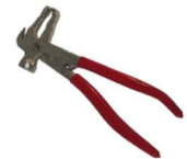
Weight Hammer 301400425