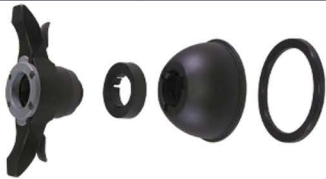
Manual Locking Kit 41FF83148