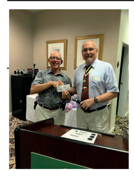
Preident Chittenden handed the $5,500 check to the Honor Flight representative.