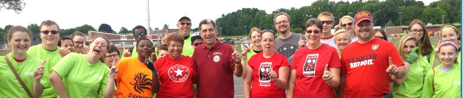
Thanks to Sunnking Recycling and Time Warner Cable for making this event possible.