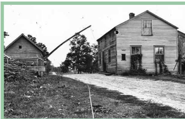
Town of Mequon toll station, 1/2 mile south of Donges Bay Road on present day Cedarburg Road, was owned and operated by The Oppel family.

To manage the affairs of the private corporation, a plank road toll office was constructed. This building was located at the north east corner of what is now the intersection of Freistadt and Main Street in Thiensville. Toll gates were also constructed, at no less than 3 mile intervals, in order to provide capital for the maintenance of the plank road. Prior to 1860, when the toll road was owned and managed by the Milwaukee-Fond du Lac Plank Road Company, the toll collected at each location was two cents per horse. However, upon new ownership, the toll was lowered to one cent per horse. Residents travelling to church