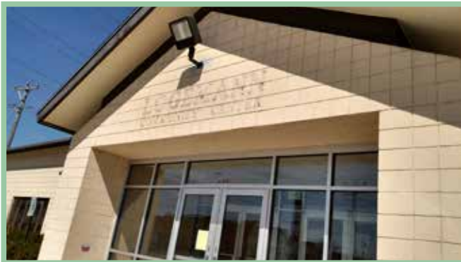
The Logemann Community Center ceased operations at the end of 2015.