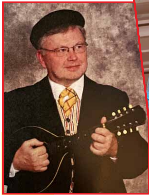
Lyndon Johnson stories and music of Swedish-American Heritage