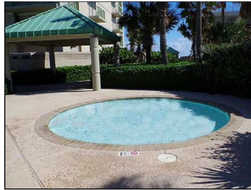
kid pool There is a shallow kiddie pool on the west side.