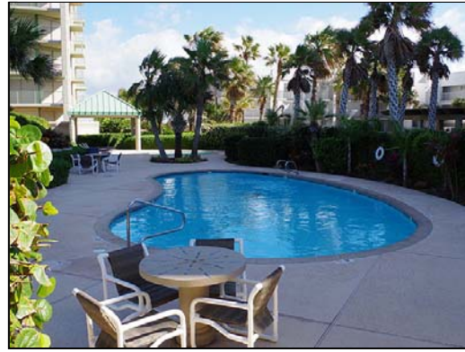
west pool The pool on the west side is heated.