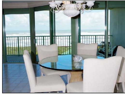
dining Open concept living/dining area with ocean views.