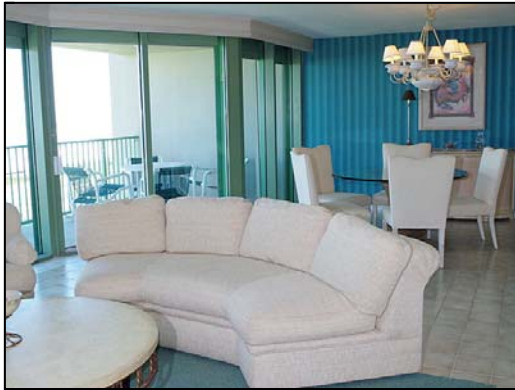
living/dining Condo is fully furnished and ready for you to move right in.