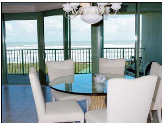
dining The dining room has a sunning Gulf view.