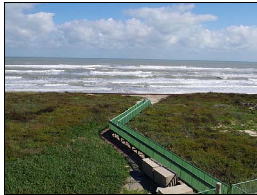
view View of the Gulf from the living/dining area and balcony.