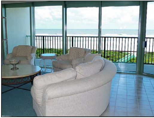
living Open concept living/dining area with ocean views.