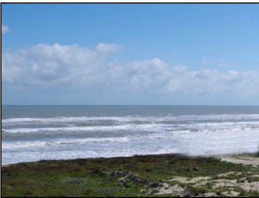
view View of the Gulf from the living/dining area and balcony.