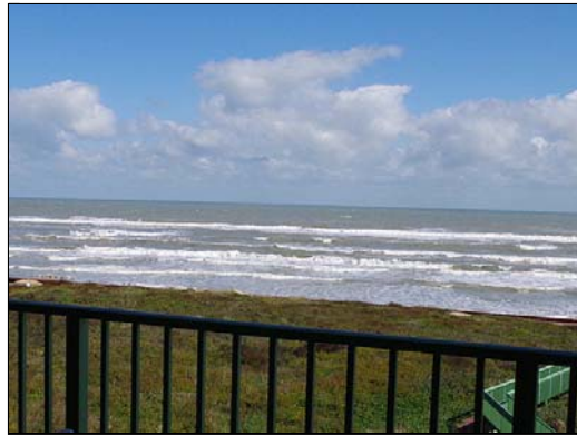
view View of the Gulf from the living/dining area and balcony.