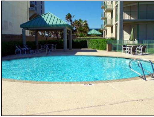
east pool The pool on the east side has an ocean view, cabana for shade, and gate with walk-over to the beach.