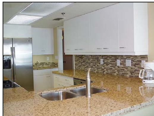
kitchen Granite counters, glass tile backsplash, and stainless steel appliances updated in November 2015.