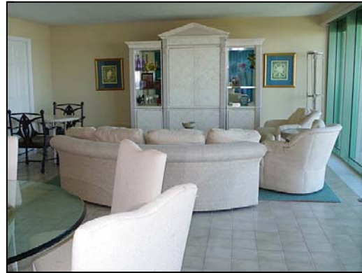
living/dining Condo is fully furnished and ready for you to move right in.