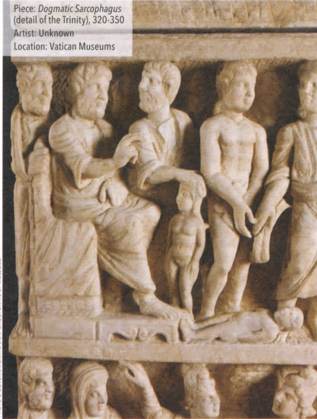
Piece: Dogmatic Sarcophagus (detail of the Trinity), 320-350 Artist: Unknown Location: Vatican Museums