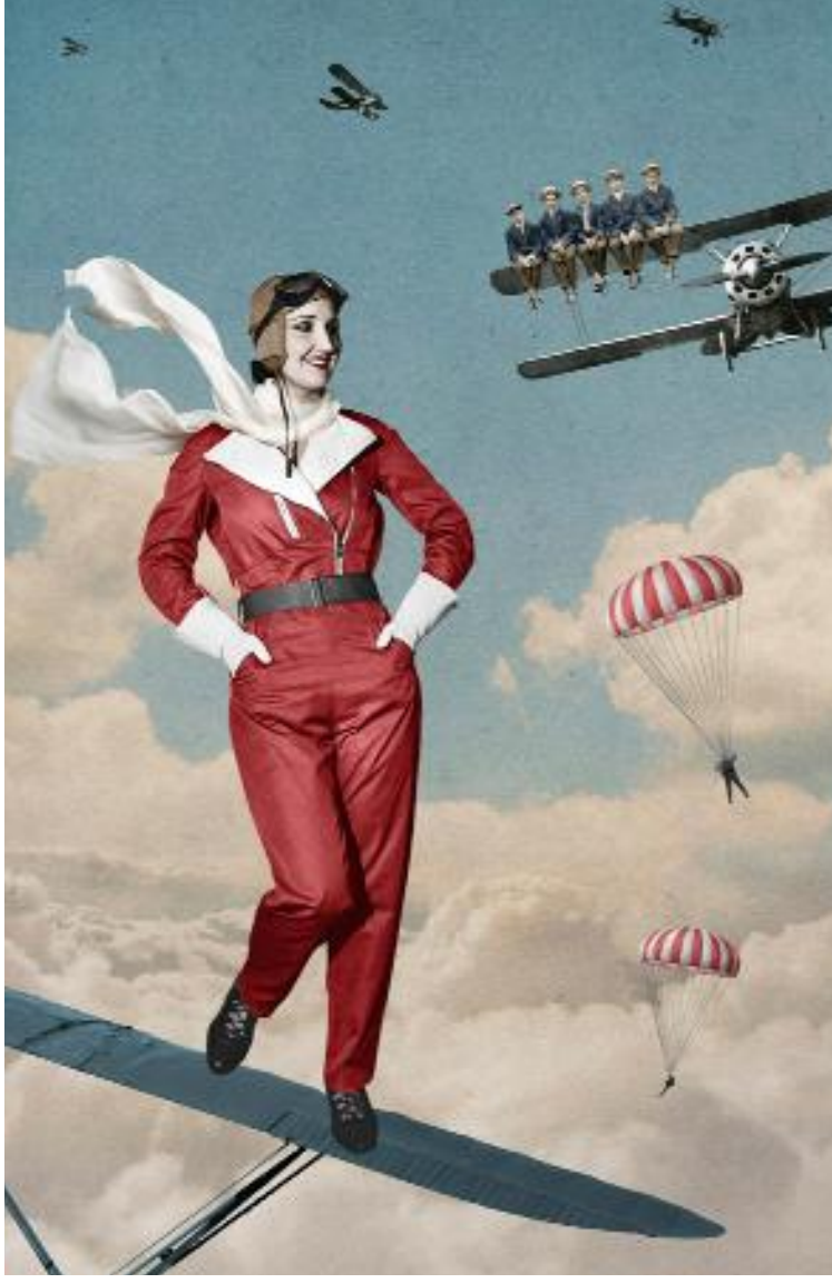
Conference participants will see Misalliance, by Bernard Shaw.