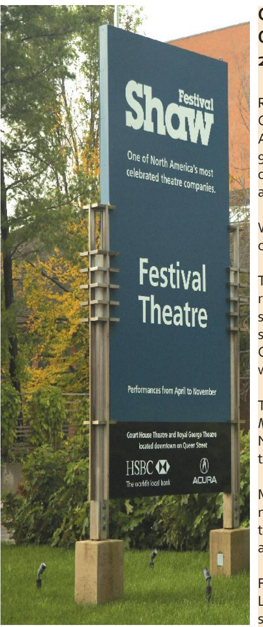
Monday morning sessions take place at the Festival Theatre, our main stage.