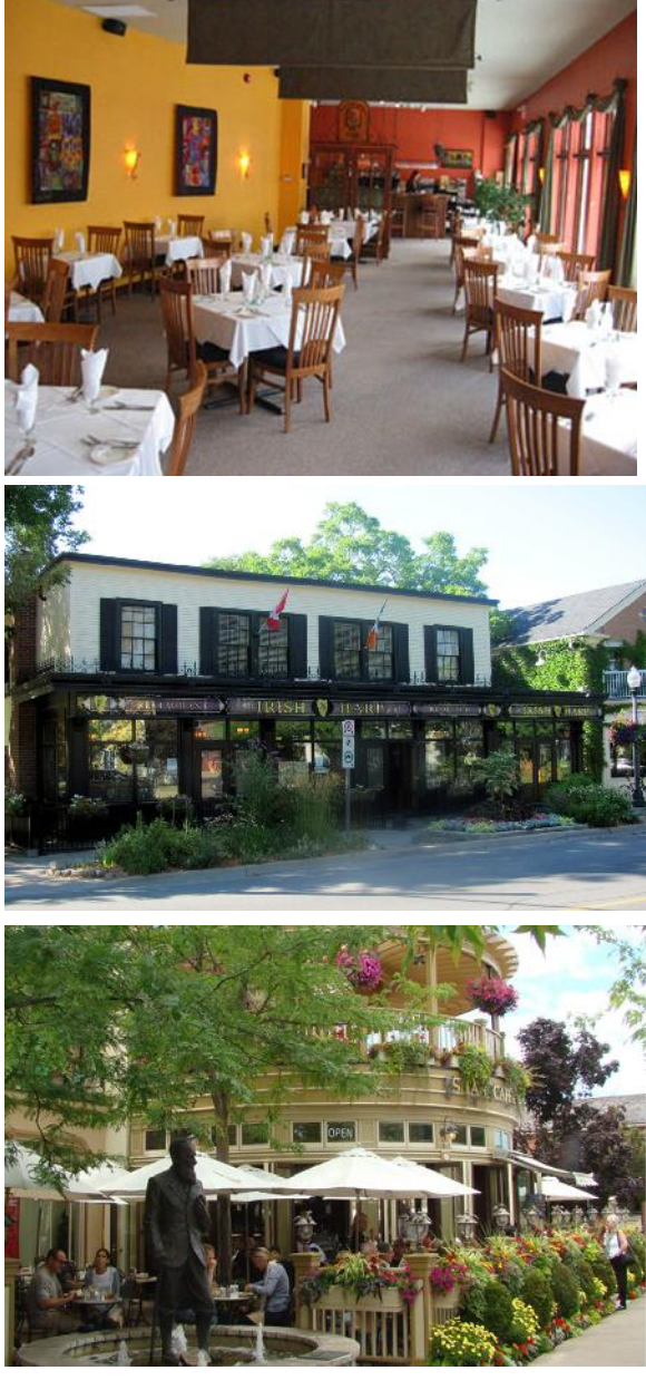
Top to bottom: Terroir La Cachette, the Irish Harp Pub and the Shaw Café and Wine Bar.

The Epicurean ( www.epicurean.ca ) has provided its fresh dining experience to locals and visitors alike since 1991. The menu and style of service is tailored to customers' needs, as a casual café during the day and as a sit-down bistro from 5:30 p.m. on. The wine list is extensive and affordable, featuring a wide variety of Niagara wines.