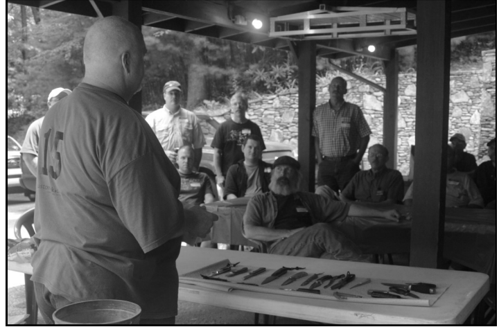
A guest collector discusses what he looks for when purchasing knives for his collection