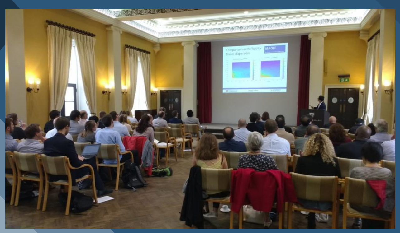
September 2018 Partners Meeting @ Downing College, Cambridge

We'd like to thank all our presenters and everyone who took part in the discussion, making it a very informative and productive day.