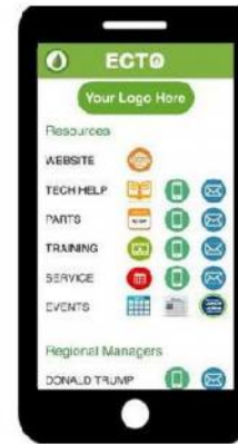
VENDOR APP PAGE