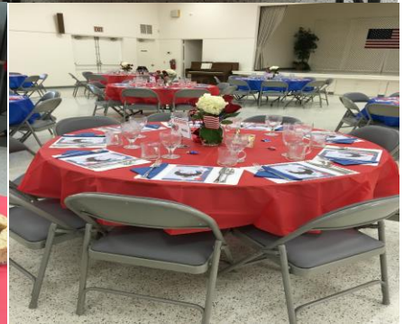
Grandparents' Day - September 11, 2016