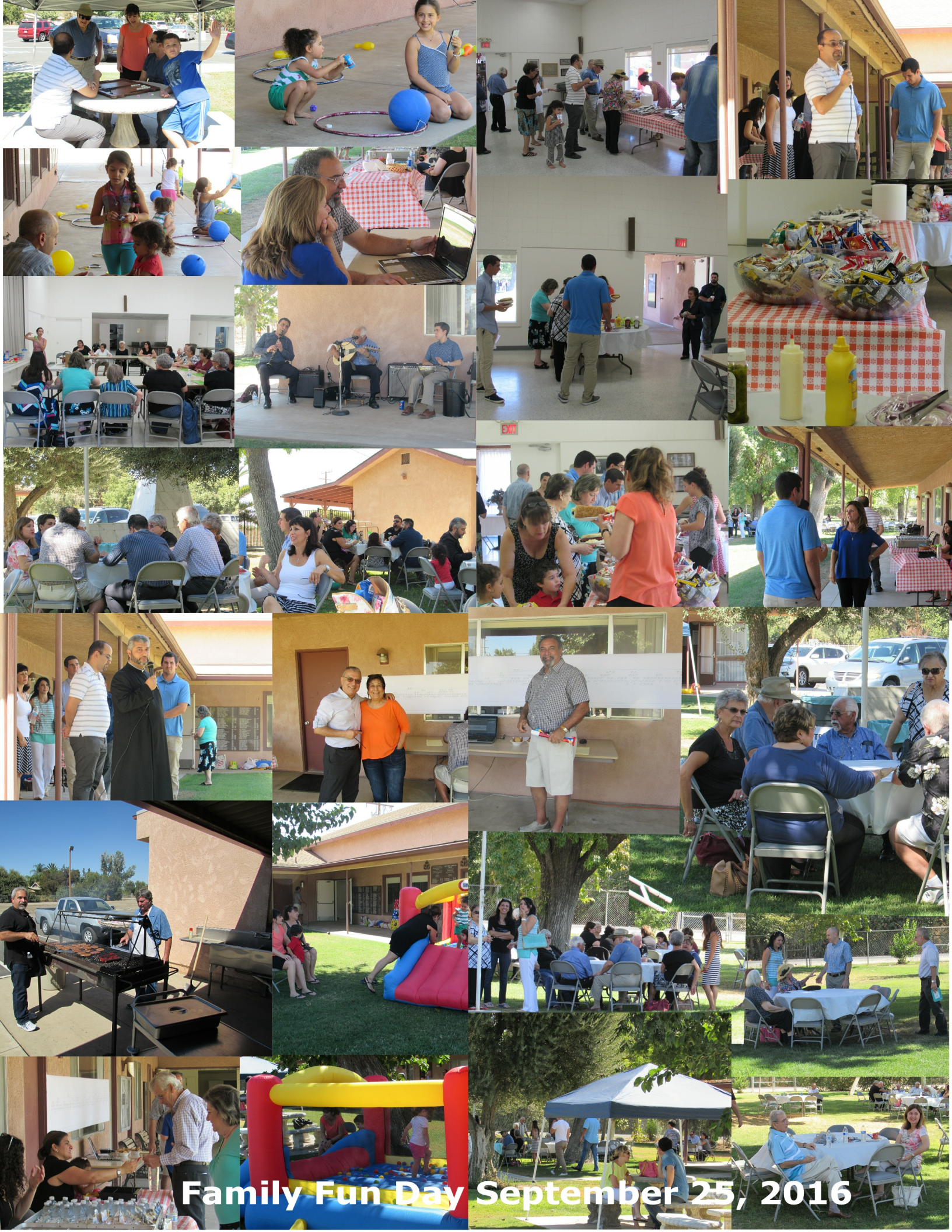
Family Fun Day September 25, 2016