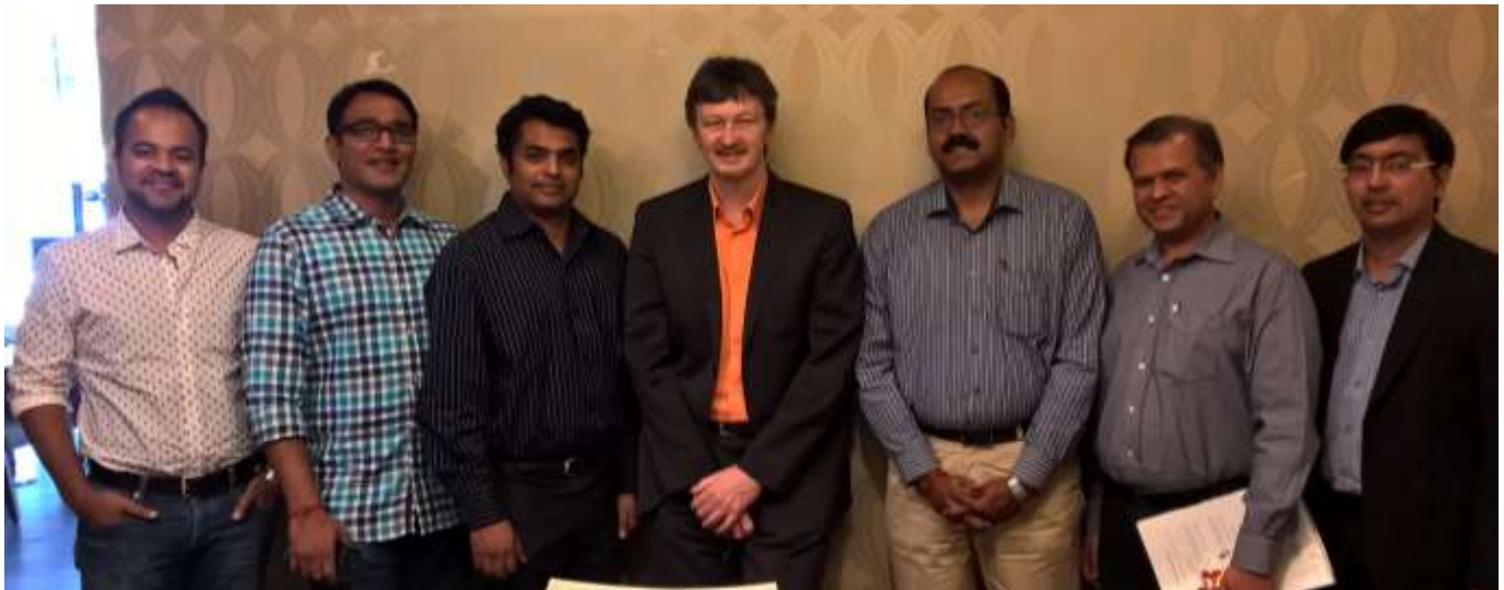
General meeting of the members of ABMSS was held in Bangalore on the 24th of February 2015