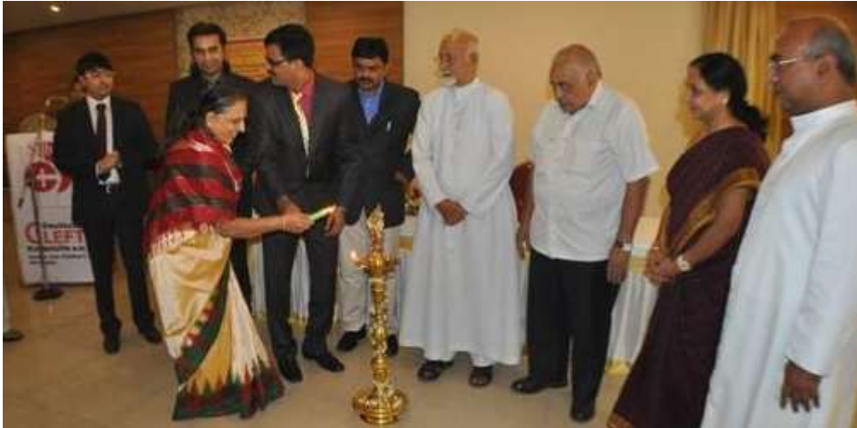
November, 2014 - Workshop on Anaesthesia for Cleft Surgery, Mysore