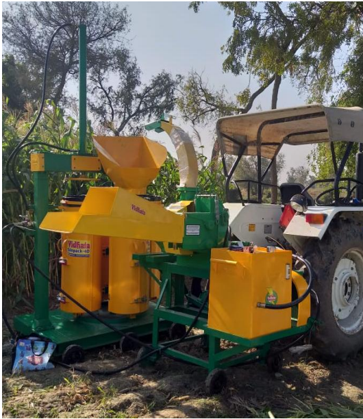
OPERATED BY TRACTOR OR 15 HP ELECT. MOTOR