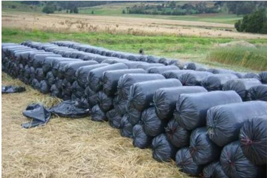
STORAGE OF BAGS