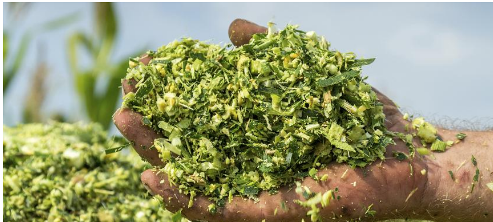
READY SILAGE 50-55 KG EACH BAGS