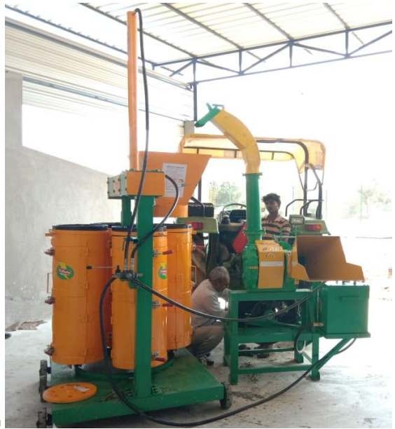
SILAGE MACHINES WITH 4 SPECIAL DRUM PACKING