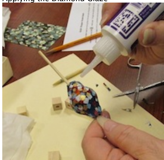
Applying the Diamond Glaze