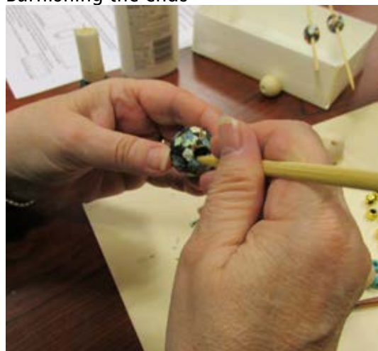
Burnishing the ends