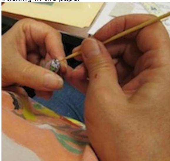
Tucking in the paper