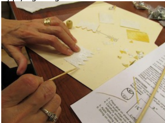
Applying the glue