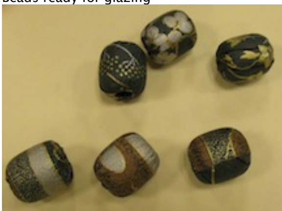
Beads ready for glazing