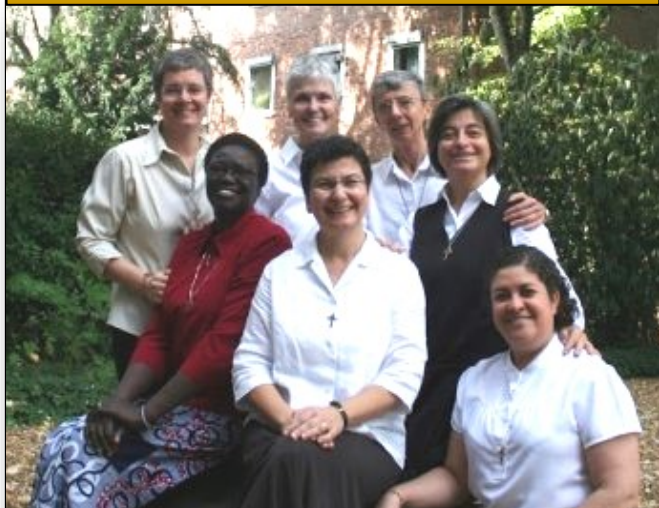
SPF International Leadership Team

The 15 th General Chapter of the Franciscan Sisters of the Poor was held in Aachen, Germany from September 8 th through September 21 st . The Chapter is a direction setting gathering to establish the thrust of the Congregation for the next five years. Sisters and Associates came from Italy, Brazil, Senegal, the Philippines and the States for the occasion. In some way, it was like a family reunion with a serious agenda. Time was spent in receiving input from international speakers, plenty of listening with table discussions which moved the gathered body to decision making. Each day was woven with contemplative stillness, prayer, ritual and liturgy.