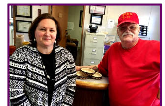
Our first cashier and customer with the first items sold at Tender Hearts Thrift Store!