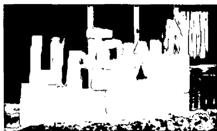
Uptown Store Ice Sculpture