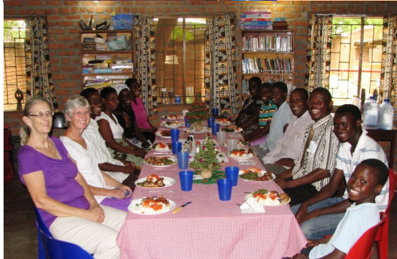
With thankfulness for and Appreciation of our TMC Committee members A FEAST!!