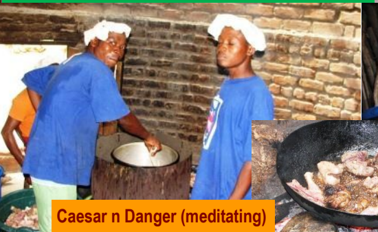
Caesar n Danger (meditating)