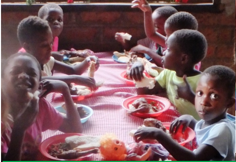
1/4 chicken each mmmm good!!!