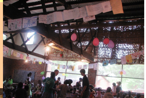
What do when your kids bring you 40 or 50 hand made Christmas cards? We shared them by hanging them in the hall.