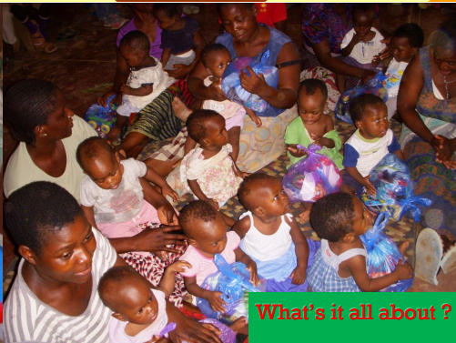
What's it all about ?