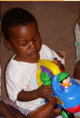
Love checkin out his truck...