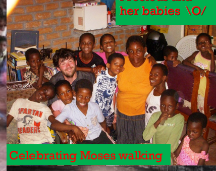
Celebrating Moses walking