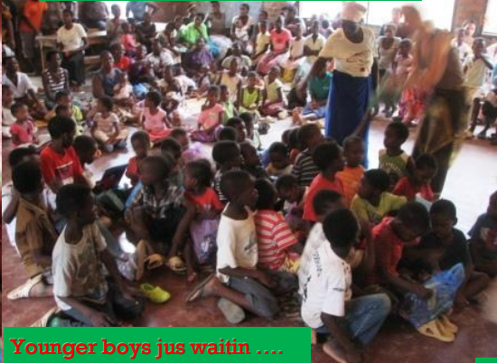
Younger boys jus waitin ....