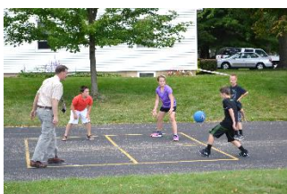
Four Square at Recess