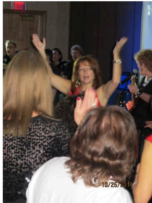
AND Playing .....