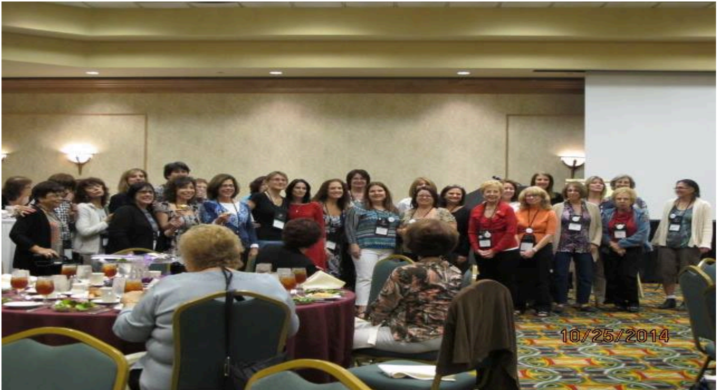
First timer's to WRJ Regional Biennial