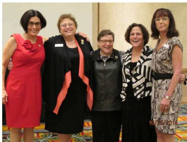
Thanks to Last Year’s Board! What a Great Year

Having given my report to the Sisterhood Board, I have some thoughts that come from the heart. My profound thanks in helping me to attend the Regional Biennial Convention. It was an enriching and life changing experience. I felt welcomed as soon as I arrived and valued as a participant. I was a “sister” to some remarkable women. The leadership of the Southern Region are some very poised and accomplished women. I learned many useful and interesting things in two days. The most important thing I learned is that I am a member of a national sisterhood whose work affects progressive Jewish women far and wide. WRJ has done wonderful work for more than a hundred years and I want to help it continue for another hundred years.