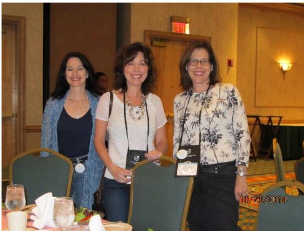
Going to sessions and LEARNING!