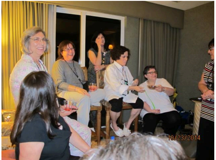
Fun at the pajama party