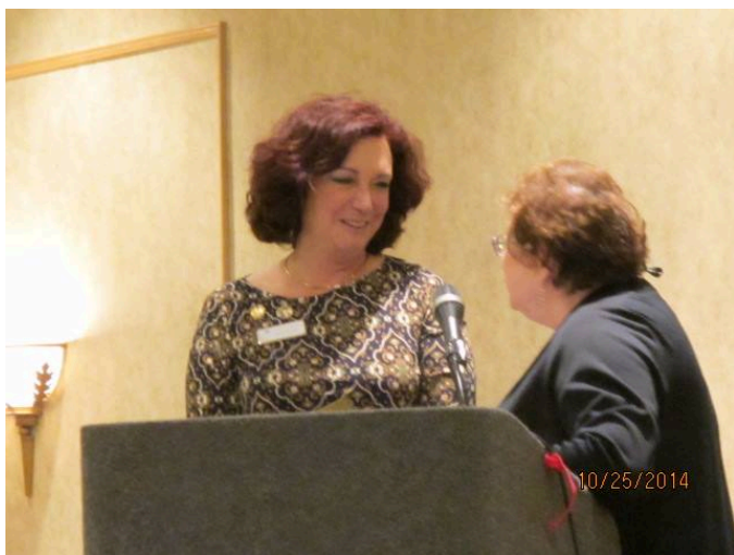
WELCOME to MADI: Looking forward to wonderful things