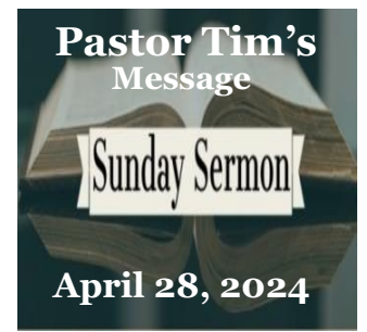
Acts 8:26-40 John 15:1-8

Our Sunday Worship Services begin at 10:00 a.m. - We will also be "live" streaming!