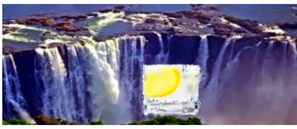
Filtered Water for good Health !!!