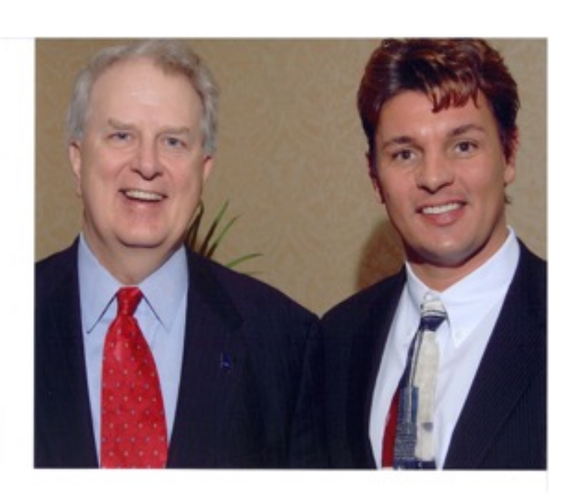
Gravedigger Ministries Fundraiser With Ex-Governor Barnes April 2006

As I mentioned before that one of my hang ups before putting my faith and trust in Jesus Christ was the uncertainty of the kind of divine relationship expected. The following are events where GOD has interacted.