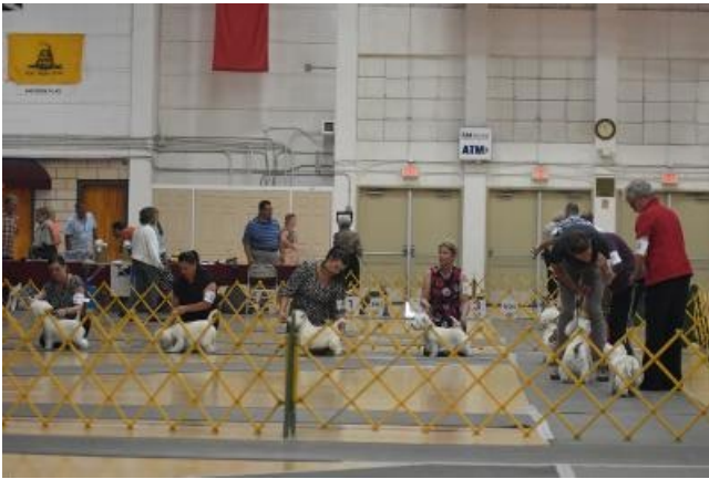
Best of Breed Competition