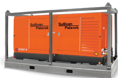
750-900 CFM Off Shore