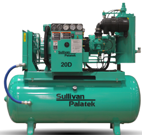
Direct Drive 15-40hp