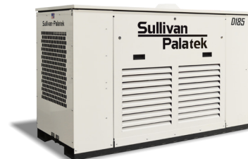
Utilities 185-260 CFM