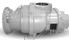
OEM Air Ends