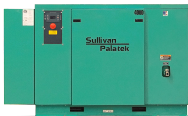
UD Series 40-60hp