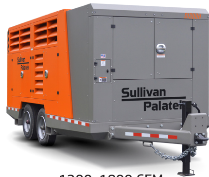
1300-1800 CFM 1150 Dual Pressure/Dual Capacity