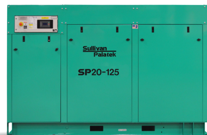
SP Series 75-500hp