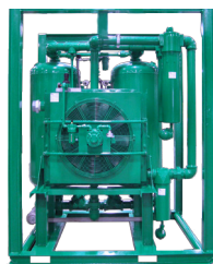
Aftercooler/Dryer Skid Package