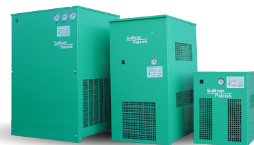
Refrigerated Air Dryers