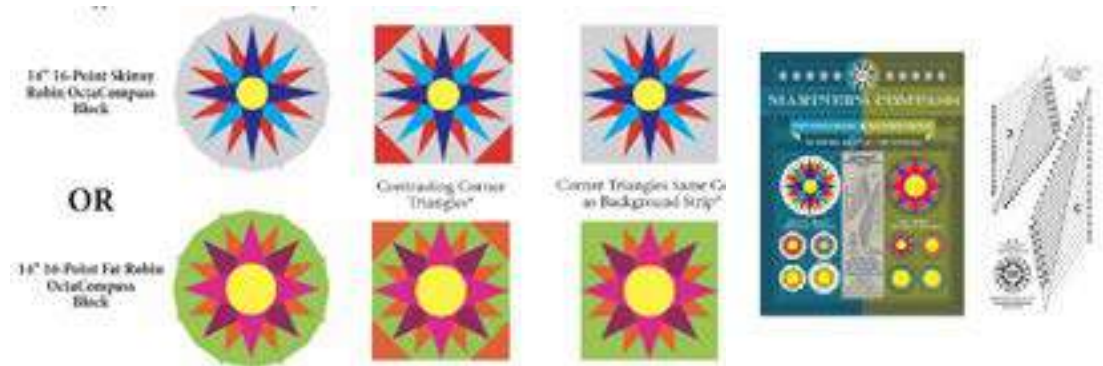
Robin Ruth Design website

For class you will need either the Skinny Robin 16-Point Mariner's Compass Book & Ruler Combo ($49.95) OR Fat Robin 16-Point Mariner's Compass Book & Ruler Combo ($49.95)- A coupon code will be provided to purchase your ruler on my website at a 10% discount. Please do not purchase on Amazon as I do not sell on Amazon. Even though it may say Robin Ruth Design, these are third party sellers and I cannot guarantee what you will receive.