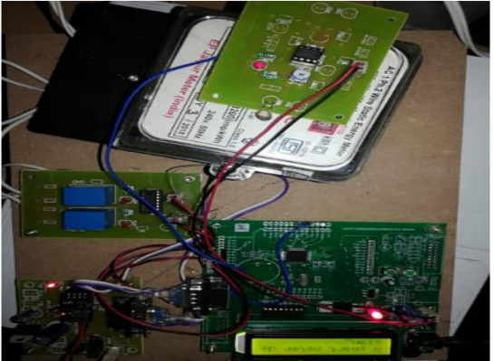
Fig.1: Working model

electricity supplier automatically, there would not be the need to have the meter mounted outside the customer premises. Placing the meters inside a garage or other room would provide a much more protected location and aid in the security of the smart grid. This would require moving or extending the power line terminus from their normal location to the interior which would add considerable expense, and most likely be prohibitive for any extensive smart grid projects. As a matter of fact, for any new homes built in areas with existing smart meters infrastructure, this may be a useful option. Data can be sent wirelessly to an access point at the power pole or via communication over the low voltage power lines.