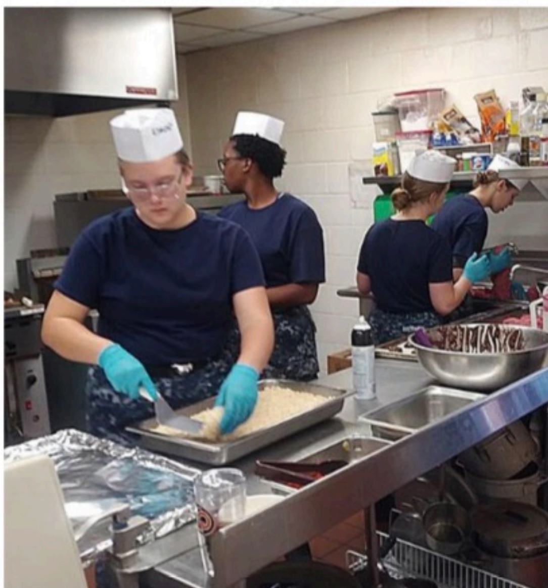
Cadets assisting Culinary Art Specialists at U.S. Coast Guard Station Milford Haven in Hudgins, VA.

NSCC also has international exchange programs in Canada, Belgium, Bermuda, Great Britain, Sweden and the Netherlands. Each summer, outstanding cadets are selected to serve as young ambassadors and to train with their foreign counterparts.