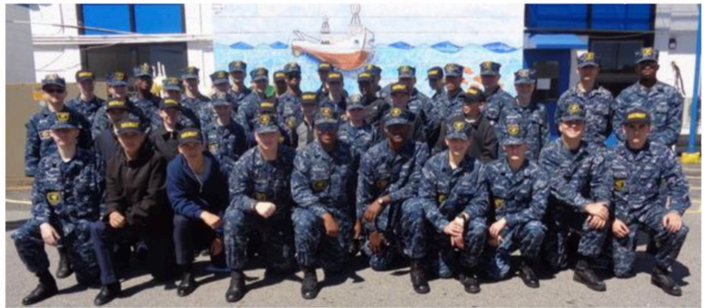
AMERICA Division Sea Cadets and staff assembled at National Oceanographic and Atmospheric Administration (NOAA).