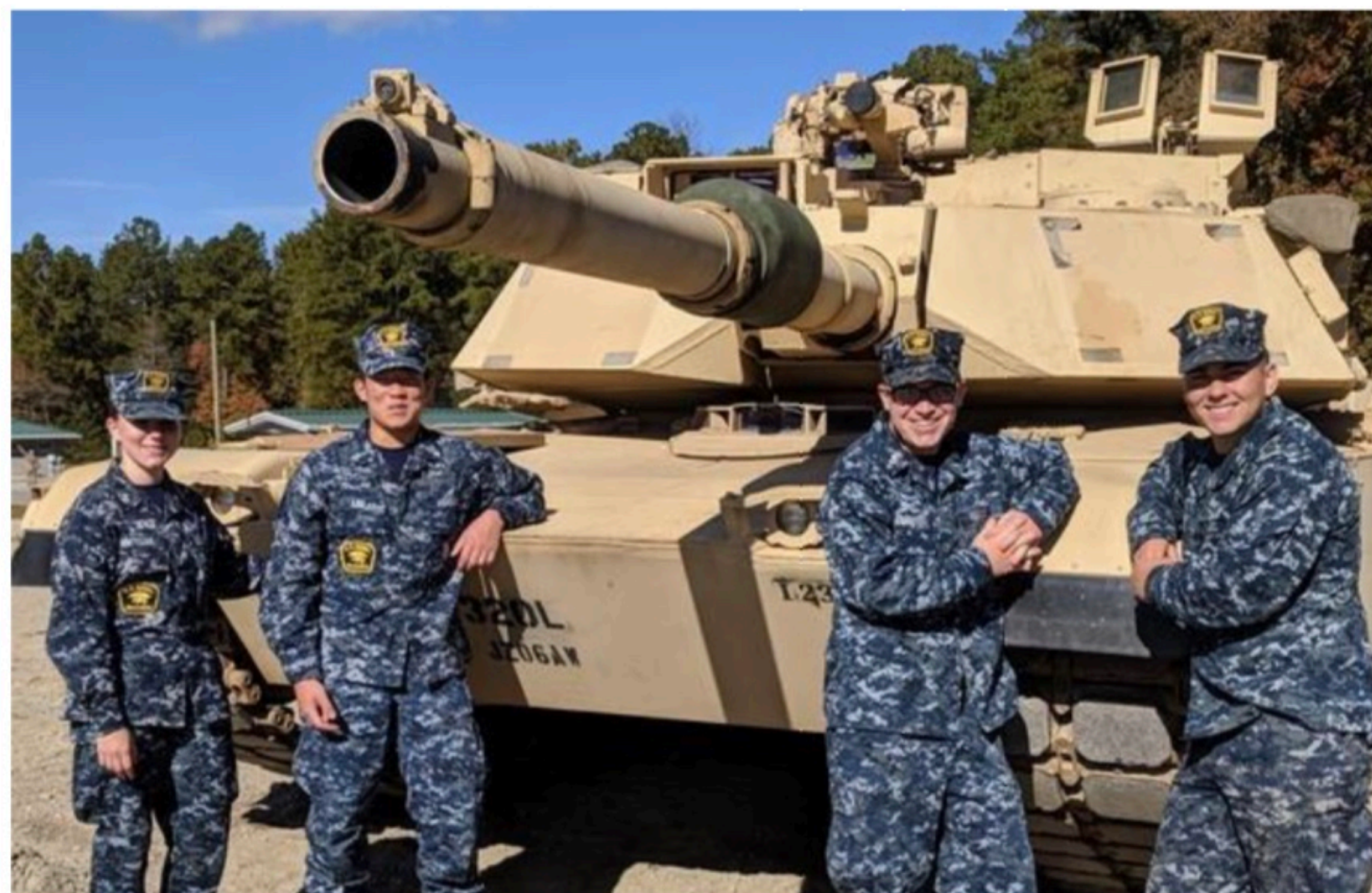
NSCC Cadets training with the 278 th Armored Cavalry Regiment at Fort Pickett, VA.