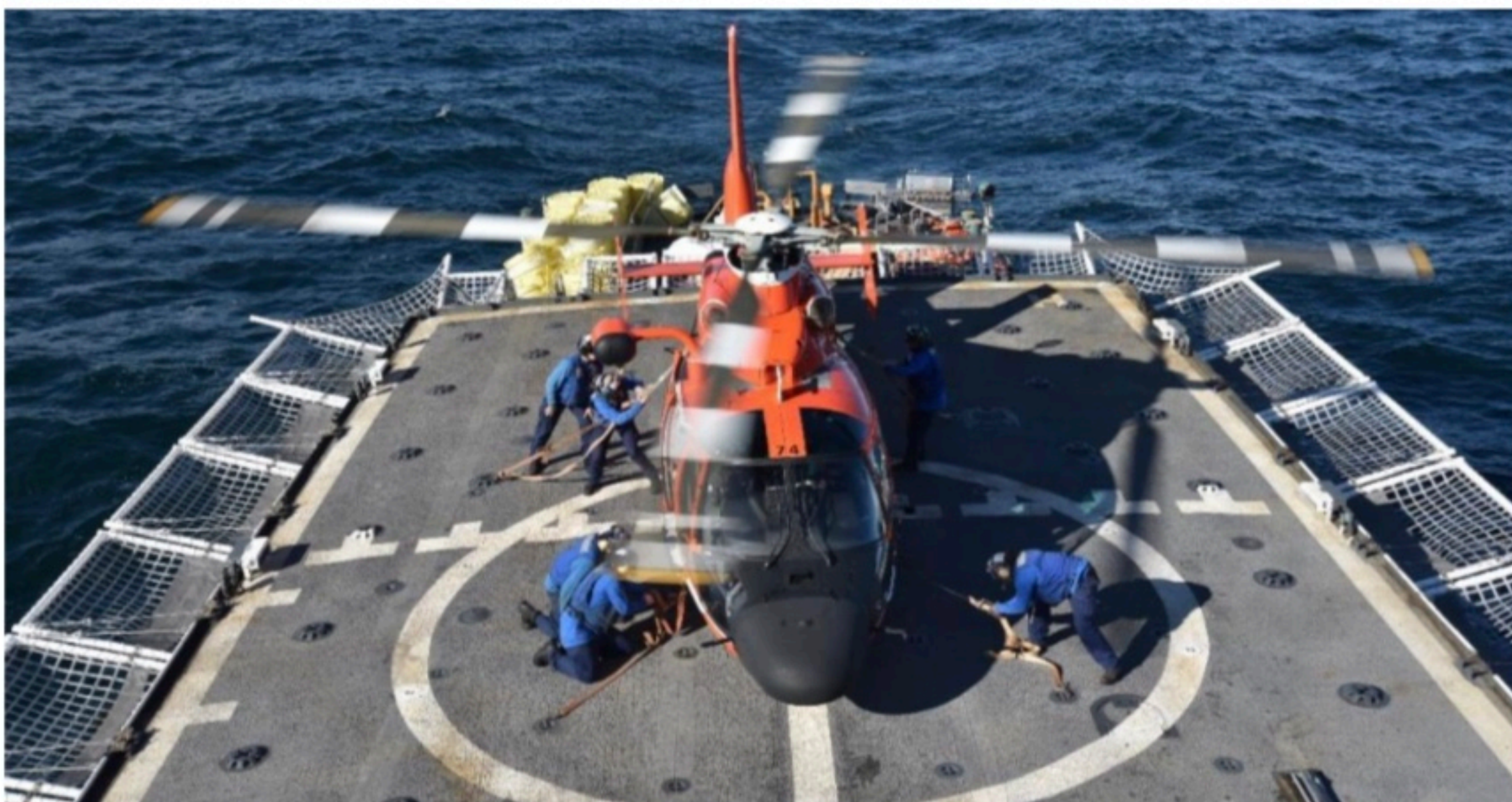
NORTHLAND's flight deck crew tying down a CG Helicopter during flight operations.

The bond between the Richmond Navy League and the USS CARTER HALL is strong and one of mutual appreciation. We truly support those who serve us... and they are grateful. ✍️