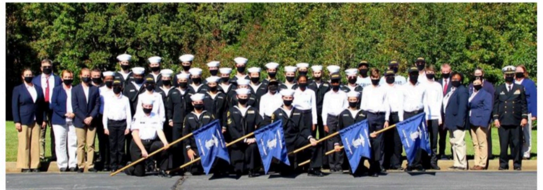
Officers, Staff and Cadets of AMERICA Division, the #2 ranked Sea Cadet Unit in the Nation.

Our Annual Fundraising Golf Outing will be held in September. Details in next issue.