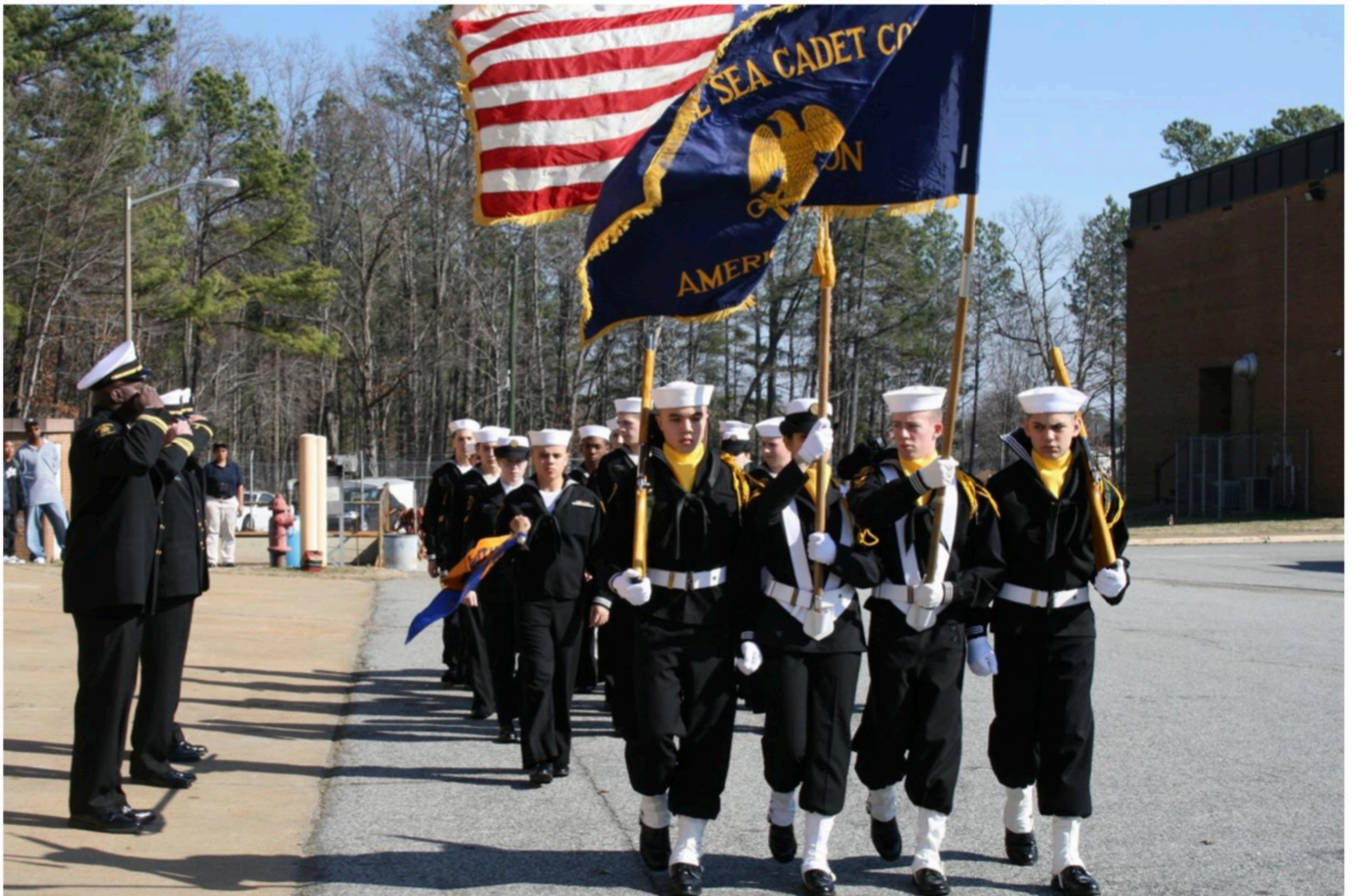
Cadets of the United States AMERICA Division Sea Cadets and League Cadet Corps parade in review.

RICHMOND COUNCIL, NAVY LEAGUE OF THE UNITED STATES