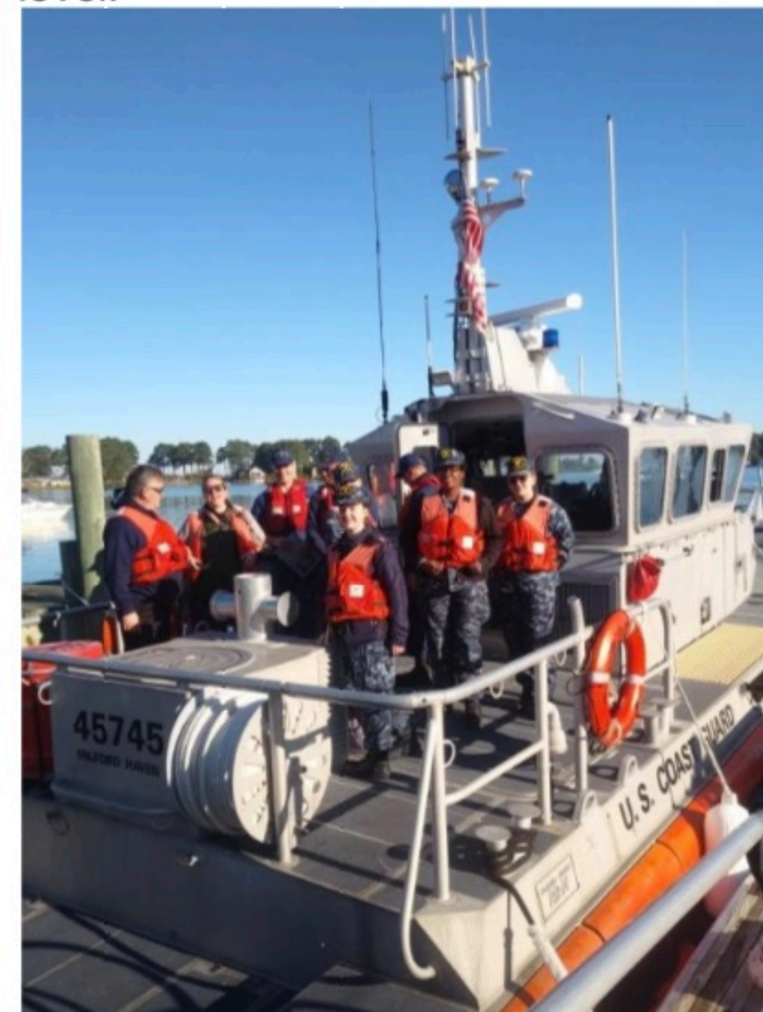
Cadets training at U.S. Coast Guard Station Milford Haven

A benefit of particular importance is the opportunity to compete for scholarships for those cadets who are continuing their education at the college level.