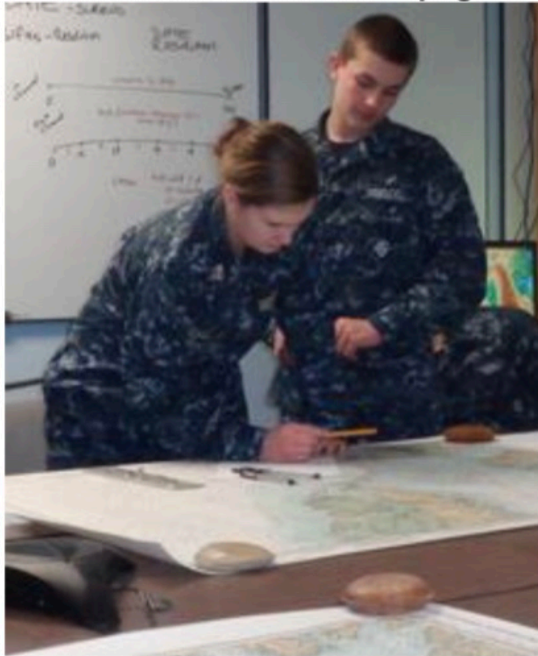
Sea Cadets learning the science of reading Sea Charts at National Oceanographic & Atmospheric Administration (NOAA) in Norfolk.